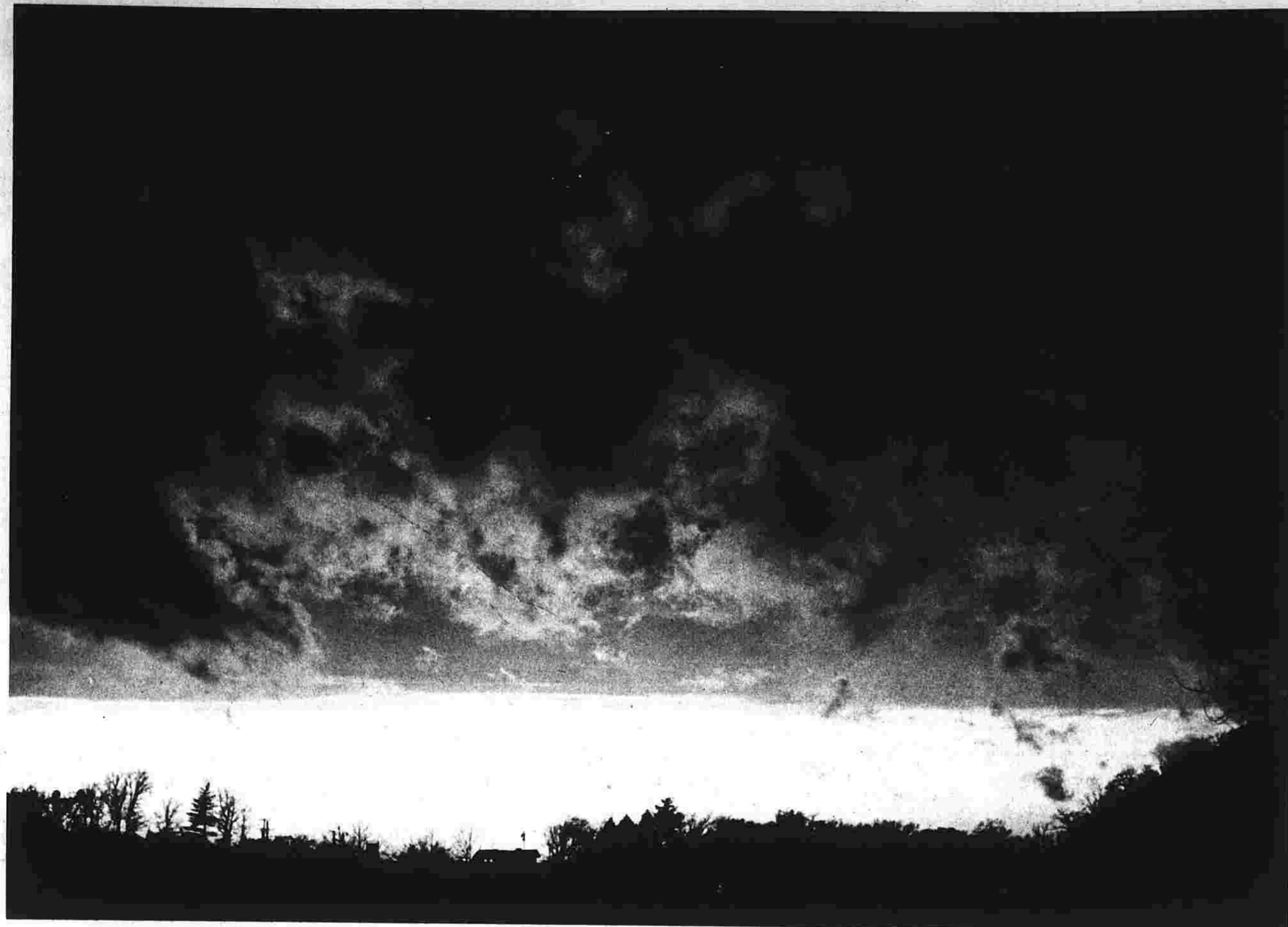
As the Storm Passes and the Clouds Lift