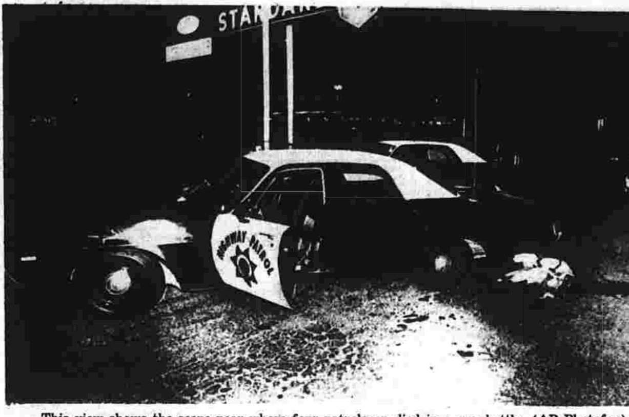
This view shows the scene near where four patrolmen died in a gun battle.