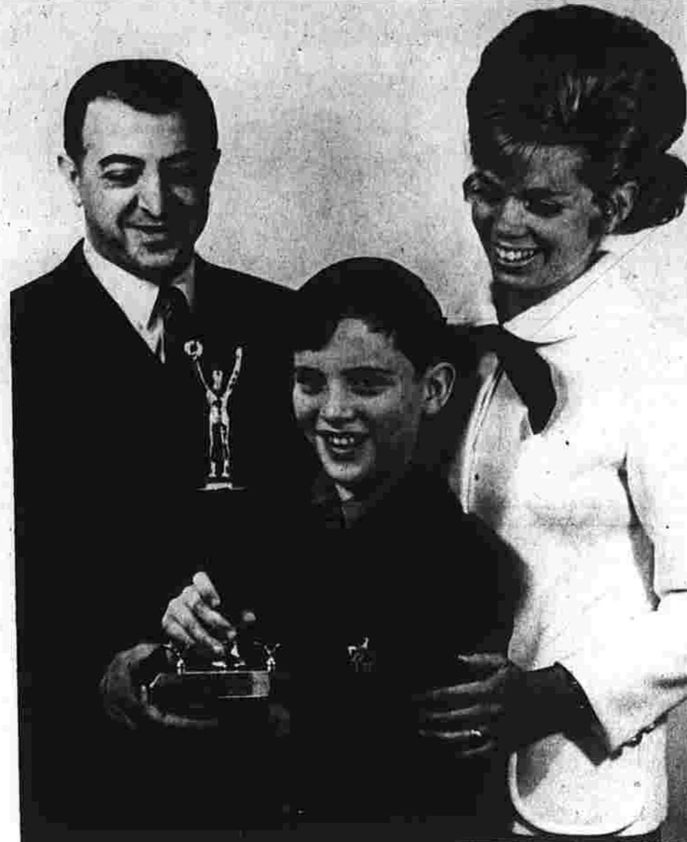
Camper of Year Wins Award