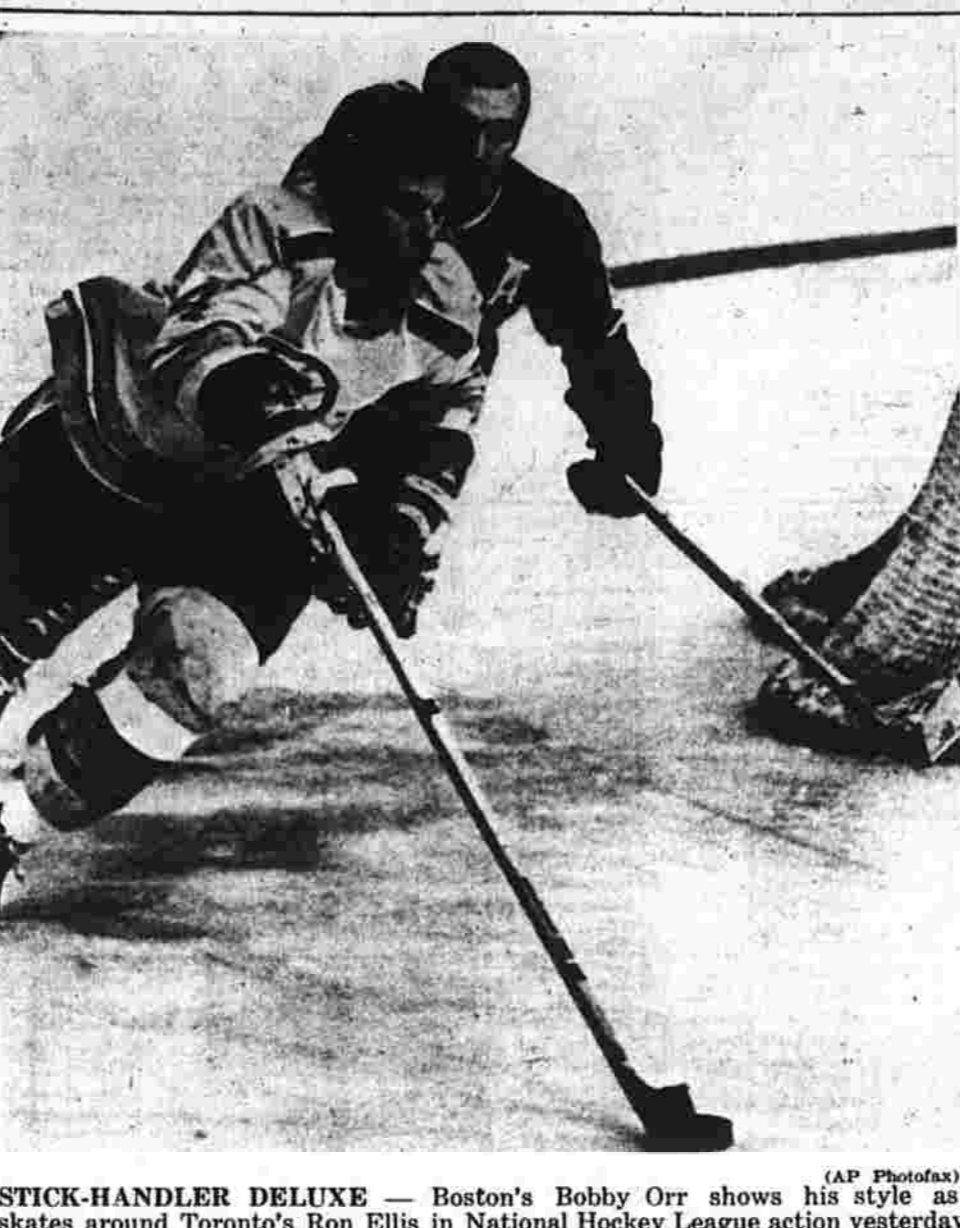
STICK-HANDLER DELUXE—Boston's Bobby Orr shows his style as he skates around Toronto's Ron Ellis in National Hockey League action yesterday.

NEW YORK (AP)—The National Hockey League's most unbelievable season ended appropriately with the Hawks jumping from last to first in the final weekend of the Eastern Division playoffs. Locked in a five-team struggle with the Rangers, the Hawks could have produced any one of 123 different finishes going into the final weekend of the Eastern Division playoffs. Chicago finished on top, capturing jump from last place position goals in an effort to be first that had never been accomplished before. NEW YORK (AP)—The National Hockey League's most unbelievable season ended appropriately with the Hawks jumping from last to first in the final weekend of the Eastern Division playoffs.