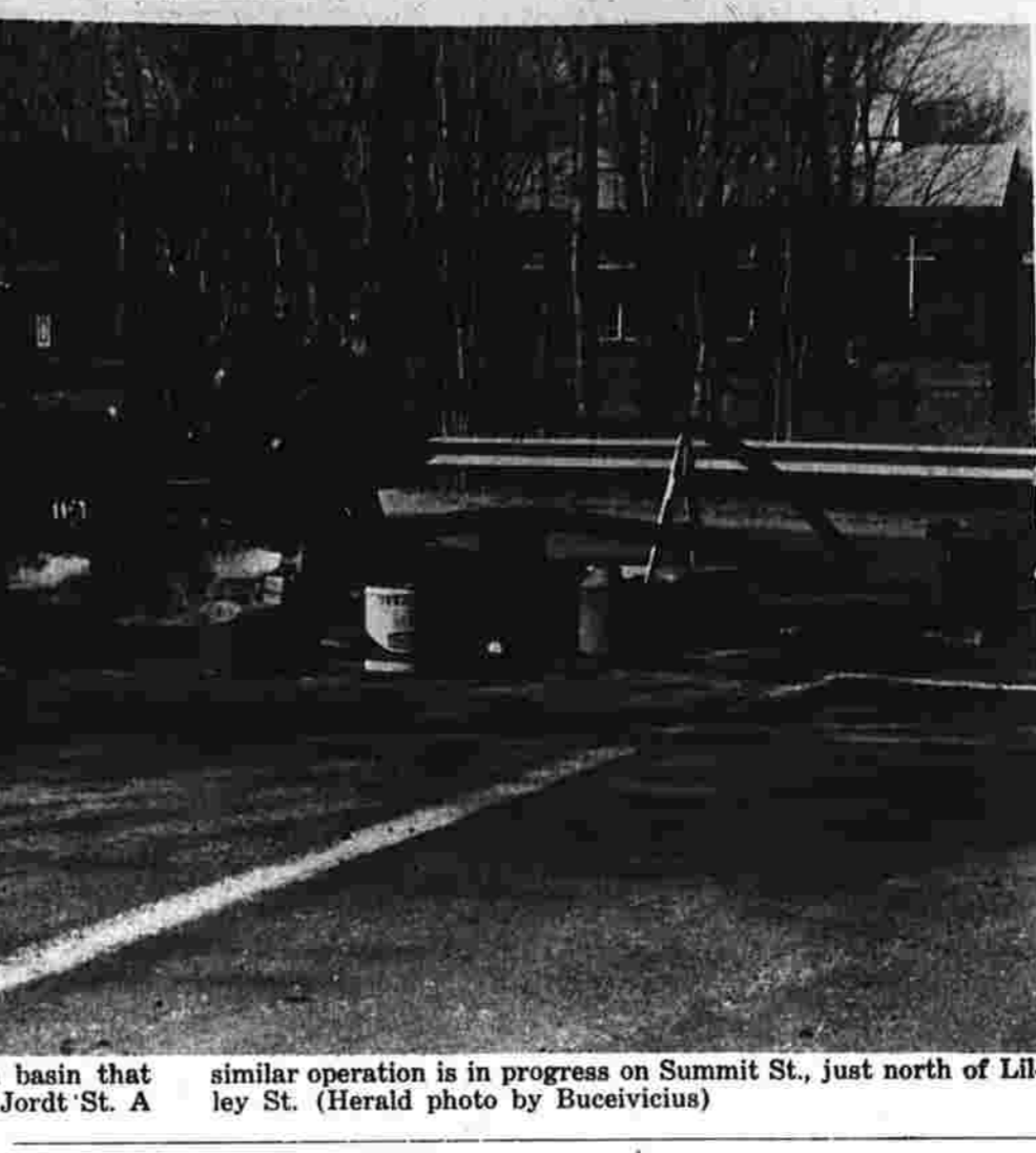
Overflow sewage runs over the street into a catch basin that empties into Bigelow Brook. This is at Parker and Jordt St. A similar operation is in progress on Summit St., just north of Lily St.

A walkout of farm carpenters may slow down construction on Rt. 6 in Manchester but doesn't look for certain yet, a spokesman from the State Bureau of Highways said today.